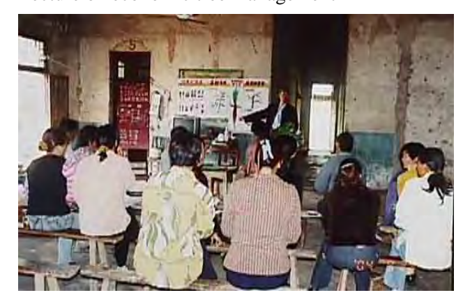
Introducing infrastructure protection with vetiver