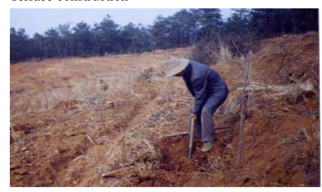
Dig pits for chestnut planting