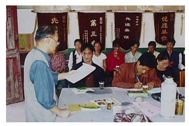
Lecture on water and soil erosion