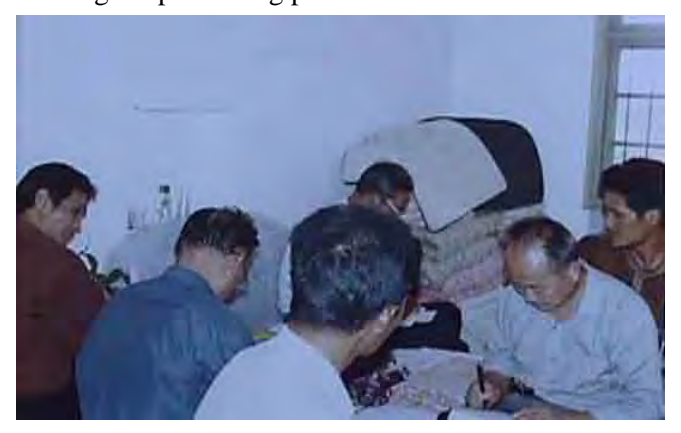
Discussing at the village hotel on further arrangement