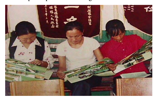
Women like vetiver poster