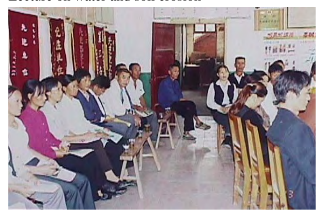
Training course at village office