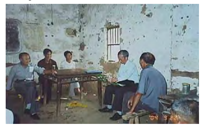
Introducing vetiver to Forestry Farm workers