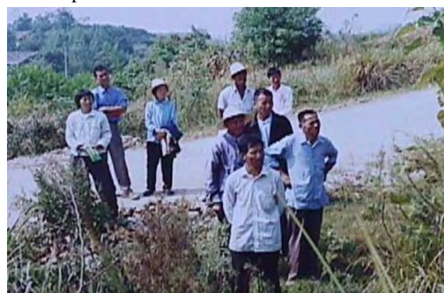
Farmers learning vetiver planting