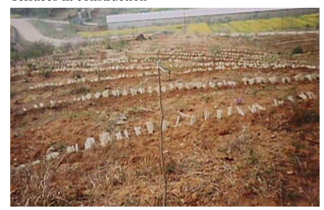
Vetiver and tree planted