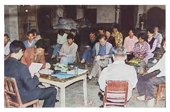
Lecture on economic tree management