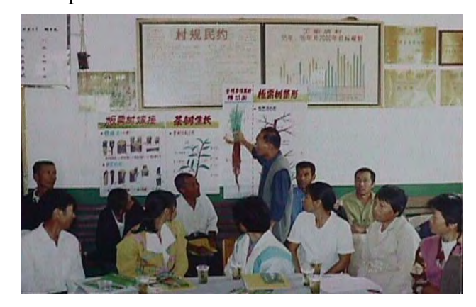
Introducing root characteristics of vetiver