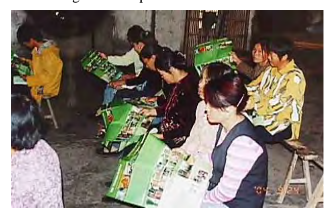
Women are fond of vetiver technology