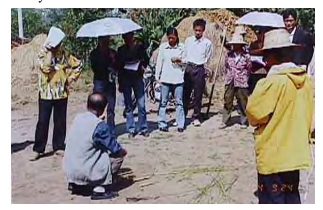
Vetiver planting demonstration outside the classroom