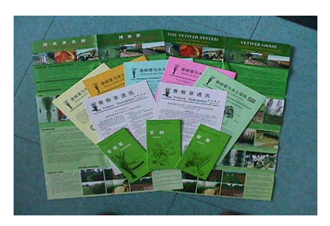
The printed training materials