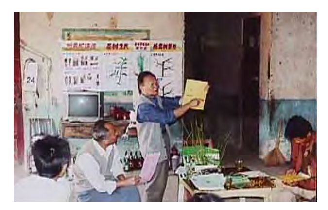
"Why vetiver can control soil erosion"