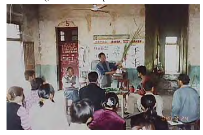
Introducing vetiver reproduction