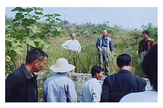
Vetiver practice in the field