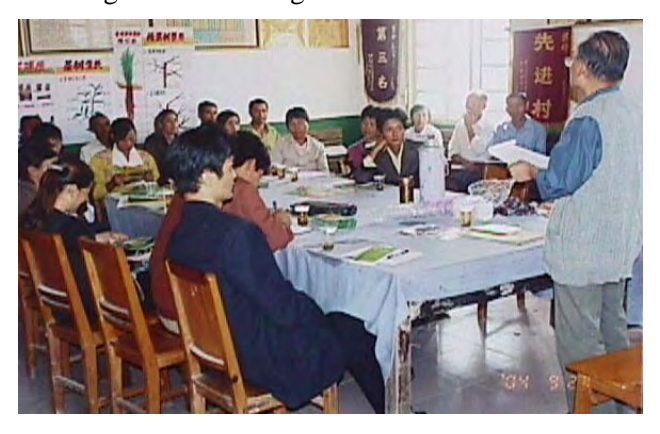
What causes soil erosion