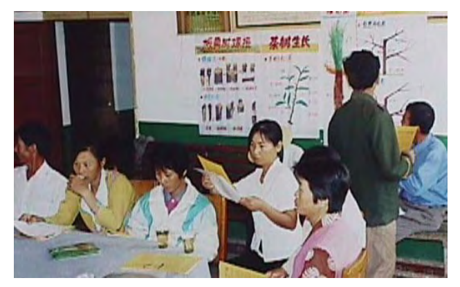
Looking at vetiver FACT Sheets