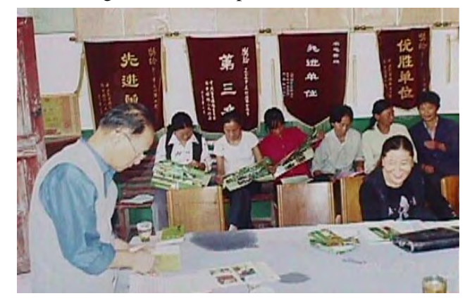
Women participants accounting for over 60%