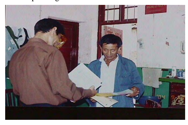
Distribution vetiver information to farmer technician