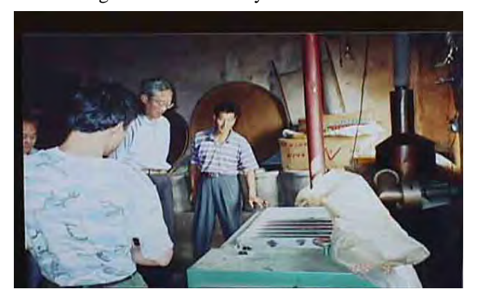
Visiting tea processing plant