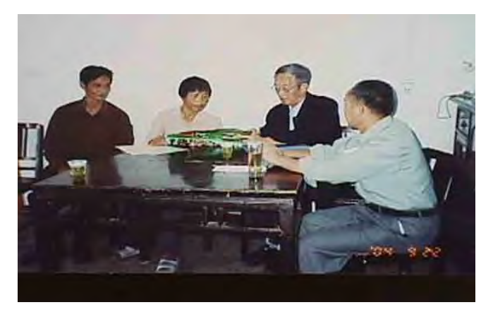
Talking with the director of woman federation